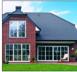
Balcony doors and terrace doors with various opening configurations