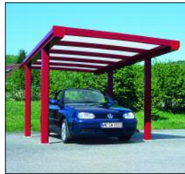
The TECTOLA aluminium system, usable as patio roofing or carports

We would be glad to give you more detailed information about Weru's complete assortment: