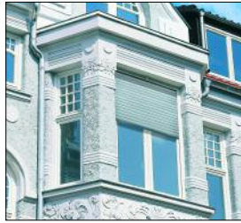
Roller-shutter windows with or without motorisation and fly screens