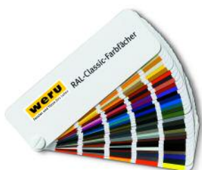
RAL classic colour swatches

Do you want to set a modern tone or would you prefer a classic expression to your lifestyle? You have the choice with ACENTO bi-folding systems because you can opt for a different colour inside from that on the outside. In addition to the wide colour choice, you have the most diverse range of anodized surface finishes.