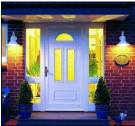
Front doors made from aluminium and PVCU