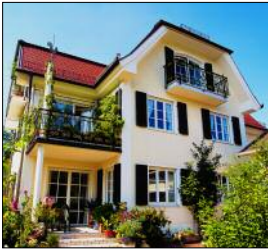
Windows made from PVCU or aluminium as well as aluminium clad PVCU