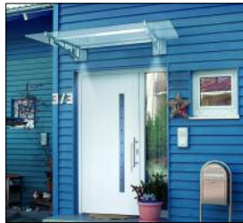
Canopies with roofs of varied shapes and colours